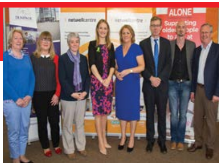
Minister McEntee with the team at ALONE North East Hub.