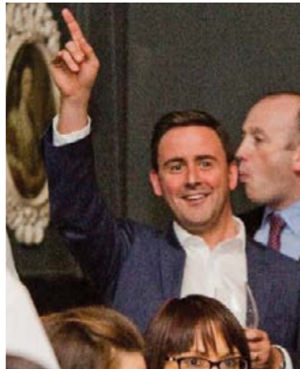
Bidder at Lisney Auction for ALONE

Lisney staff will be holding further fundraising events for ALONE throughout the year including a Tidy Up of ALONE Housing. The company will also support employees in becoming ALONE befriending volunteers and offer their professional skills by providing strategic property advice and services when necessary. Lisney launched their year long charity partnership with ALONE with an auction on the 27th of April. The highlight of the evening was a Kerryman trying to outbid a Dubliner for the signed Dublin GAA jersey! This item alone raised a staggering €2,800.